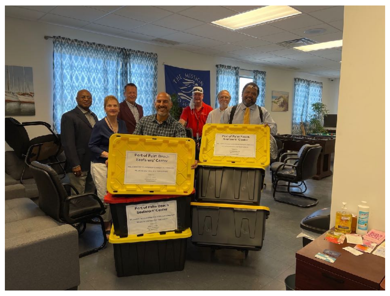
MOFFATT AND NICOL, HDR ENGINEERING, PSA MANAGEMENT, PORT OF PALM BEACH SEAFARERS CENTER VOLUNTEERS, MOFFATT AND NICOL STAFF