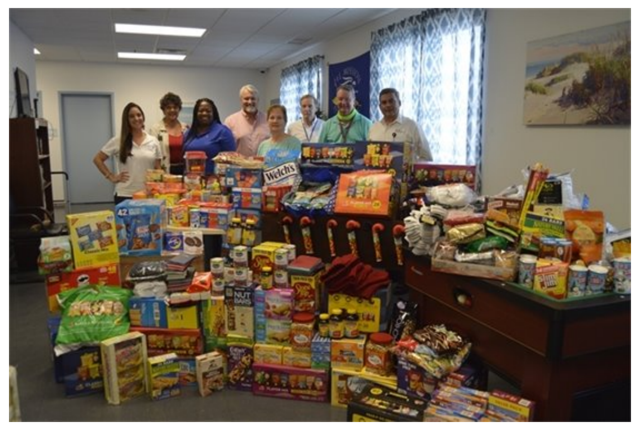
A big thank you to Port of Palm Beach Seafarers Care Package Drive